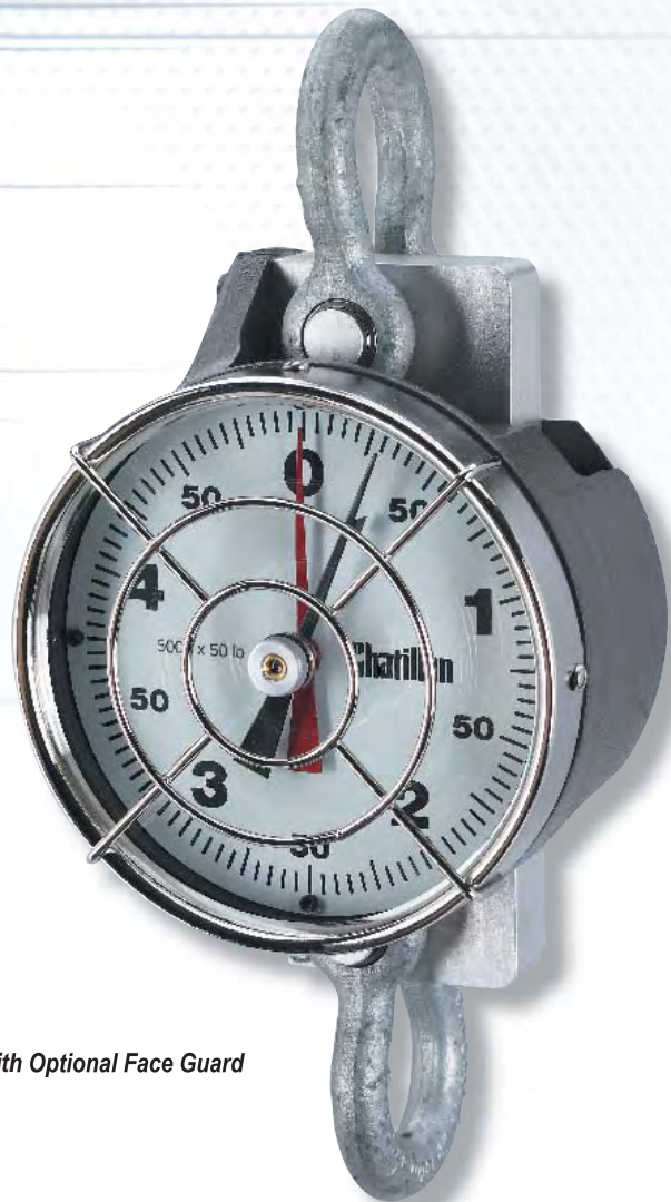
Shown with Optional Face Guard