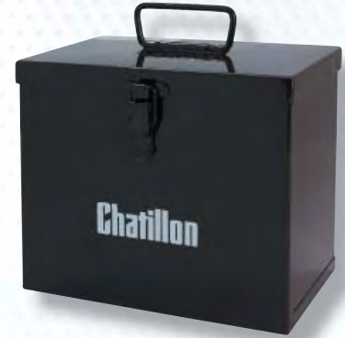
Optional Carrying Case

Dynamometers with "EH" come standard with Eye Hook. Dynamometer with "SH" come standard with Swivel Hook. Add suffix "FG" after the model number if you require the Wire Face Guard. Carrying Case must be ordered separately.