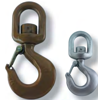
Swivel Hook - SH