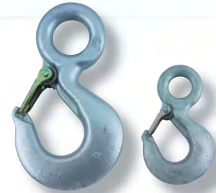
Eye Hook - EH