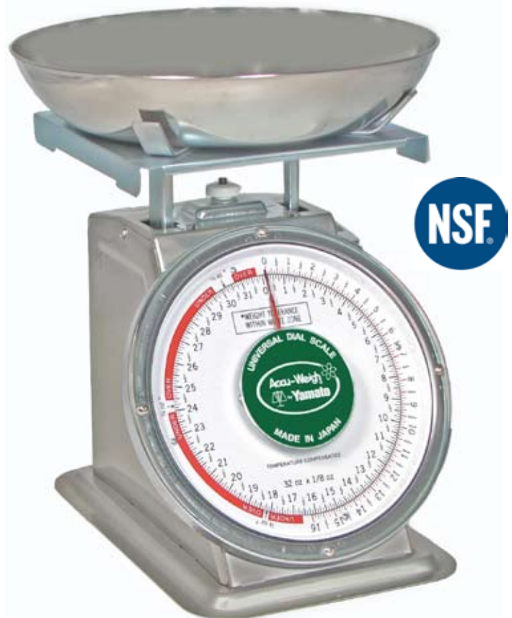
CW(N)-2/SS with OUD-171