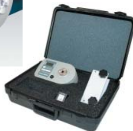
Optional carrying case

Series ST Torque Tool Testers present a simple, yet accurate solution for testing torque screwdrivers, wrenches, and other tools. Applications exist in manufacturing facilities in virtually every industry. The ST features a solid aluminum housing, making it rugged enough for many years of service in production or laboratory use, while a universal receptacle with square drive and grooves accepts common bits and attachments. The ST captures peak torque in both clockwise and counterclockwise directions.