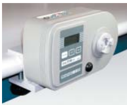
Optional bench mounting bracket